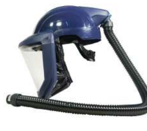
SR580 supplied air helmet & visor