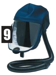
SR520 soft light-weight face hood

The SR 507 supplied air attachment is designed for connection to Sundström hoods, helmets and visors. This combination forms a breathing apparatus designed for continuous air flow, for connection to supplied air. A flow meter and warning whistle for temporary and continuous monitoring of the air flow rate are included, as is a control valve mounted on the user's belt.