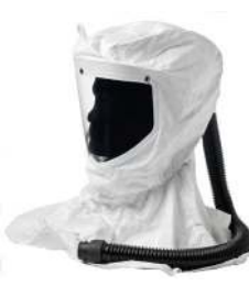
SR561 soft light-weight splash hood