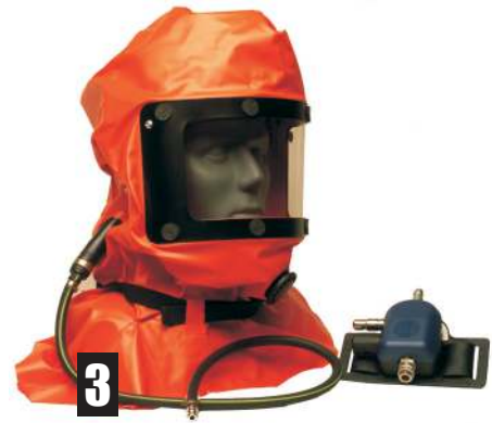
1 SR99 supplied air filter 2 Air hose 3 SR63 supplied air hood