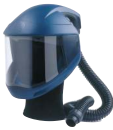
SR540 hard head shield