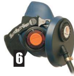
4 SR307 air regulator with adapter 5 SR200 full face mask 6 SR100 half mask 7 SR65 protective hood