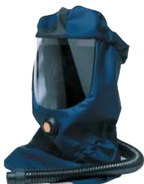
SR530 soft head & shoulders hood