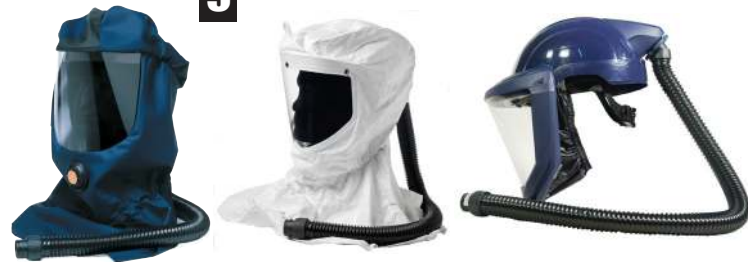
8 SR507 air regulator 9 Various supplied air hoods and helmets