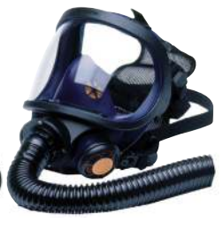
SR200 full face mask with supplied air hose