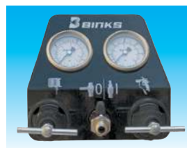
Easy to use controls