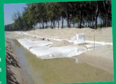
Fig. 6 Soft Rock Containers on site and ready to be filled

"Hard" beach stabilization structures, such as rock, may protect structures behind the beach, but, in stopping wave action from going beyond those rocks, hard solutions almost always cause erosion in front of themselves. The beach becomes inevitably narrower. The rock defense may be undermined. When that erosion breaches the rocks, debris from those rocks will be left on the beach and in the surf zone, further causing disruptions. As erosion continues, rock behind the beach becomes affected and leaves hazards. Phulay Beach was experiencing exactly this type of