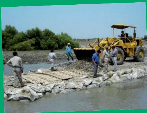
Fig. 5 Placement of cover material over the Terrafix Soft Rock® Jetty

The innovative solution shows various advantages comparing it to the original planned solution. With the Secugrid® reinforcement over the piles and the soft soil, combined with the erosionstable containment of the fill material in the Secutex® Soft Rock containers the loading and docking road is designed and built for long-term usage. Additionally the construction time frame was less than originally planned and the total costs were nearly half of the original budget. Overall: stable, safe and economically built with NAUE geosynthetics.