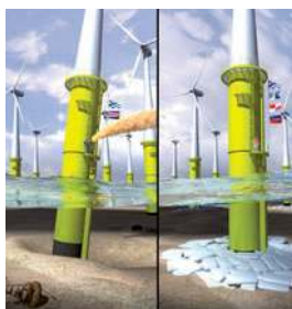
Fig. 2 Successful scour protection in an off-shore windfarm (right)

ance. Also, additional erosion control is promoted through vegetation establishment (Plant roots can hold to the fibres). Marine life can grow and flourish upon Terrafix Soft Rock® RS without damaging the containers. The unique interaction of robustness and flexibility provides high puncture resistance without sacrificing frictional or filtration properties - an excellent choice for hydraulic and sustainable engineering applications.