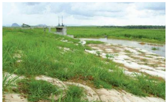
Vegetation growth shortly after con- struction