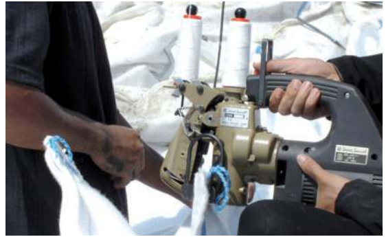
Soft Rock closure by sewing