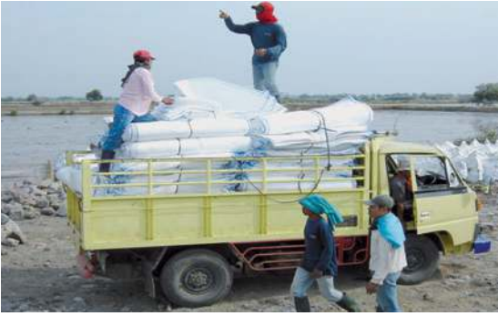
Terrafix Soft Rock® delivery on site