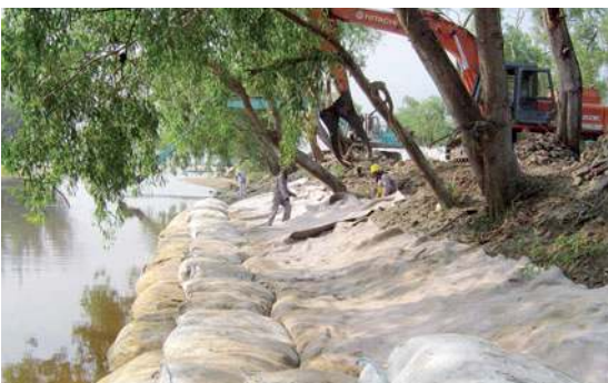
Placed Terrafix Soft Rock® prior to soil coverage