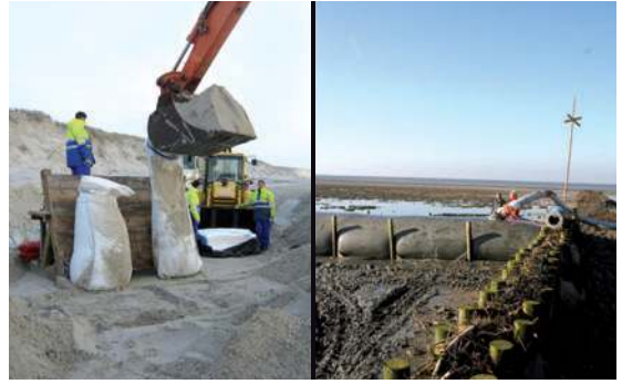
Filling of Soft Rock containers