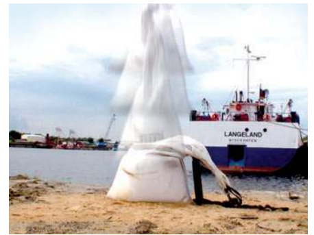
Fig. 3 Terrafix Soft Rock® container in a dropping installation performance

Beyond the long-term durability benefits provided by the robustness of NAUE's Terrafix Soft Rock®, installations are also more secure. Some installation conditions can damage many types of geosynthetics. Terrafix® geotextiles eliminate that risk. The combination of strength and flexibility allows for rough handling (such as dropping bags into place), covering with heavy riprap and placement over uneven ground. Also, the additional geotextile puncture resistance of Soft Rock RS better protects against vandalism. Safer, more intact installations lead to maximized performance and longer service life.