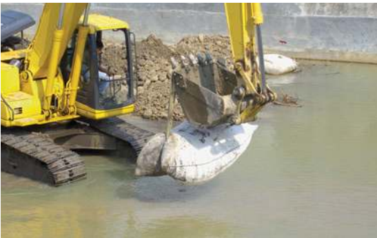
Soft Rock trans- portation without damage