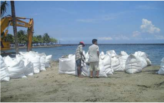
Filled Soft Rock prior to closure