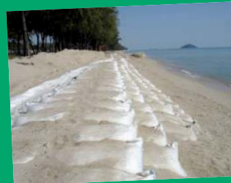
Fig. 7 Terrafix Soft Rock® protected beach line while being covered with beach sand

erosion. The solution was to soften up the erosion control approach with Soft Rock, a sand-filled geotextile container made of non-woven staple fibre geotextiles.