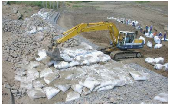
Placement of Terrafix Soft Rock®