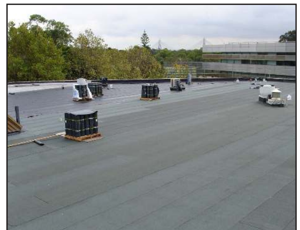
Testudo Mineral (Grey)