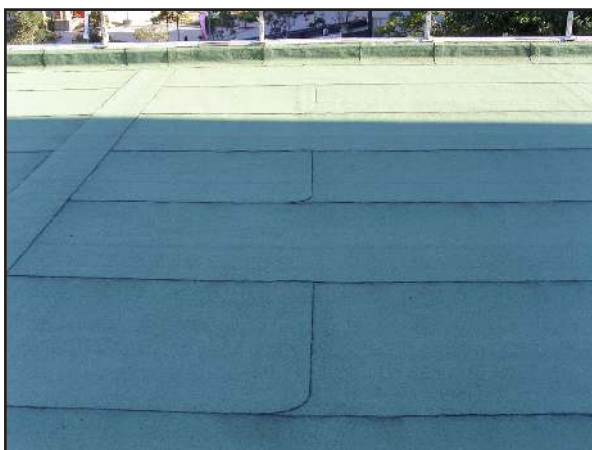
Testudo Mineral (Green)