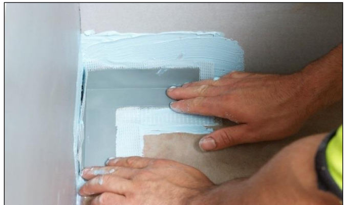
Installing Elastoproof Prefabricated Corners

Measure and cut Elastoproof Joint Band for all wall/floor junction areas. Apply first coat of Gripset C-1P membrane to extending 150mm up walls and on to floors, and embed Elastoproof Joint Band into wet bed of liquid membrane, ensuring fabric edges are fully wet out and no air bubbles exist behind the fabric. Rear rubber section of Elastoproof Joint Band is not bonded to substrates. At sections where Joint Band is to be joined, a minimum 50mm overlap is required. Elastoproof Prefabricated Corners are available for both internal (90°) and external (270°) junctions, enabling Joint Band to overlap and avoid joint at critical areas. If Prefabricated corners are not used, Elastoproof Joint Band is to have bottom leg cut and folded; ensuring fabric is completely bonded with Gripset C-1P membrane.