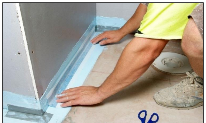
Installing Elastoproof B50 Bond Breaker Joint Band