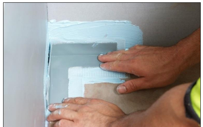
Installing Elastoproof Prefabricated Corners

Measure and cut Elastoproof Joint Band for all wall/floor junction areas. Apply first coat of Gripset 2P membrane to extending 150mm up walls and on to floors, and embed Elastoproof Joint Band into wet bed of liquid membrane, ensuring fabric edges are fully wet out and no air bubbles exist behind the fabric. Rear rubber section of Elastoproof Joint Band is not bonded to substrates. At sections where Joint Band is to be joined, a minimum 50mm overlap is required. Elastoproof Prefabricated Corners are available for both internal (90°) and external (270°) junctions, enabling Joint Band to overlap and avoid joint at critical areas. If Prefabricated corners are not used, Elastoproof Joint Band is to have bottom leg cut and folded; ensuring fabric is completely bonded with Gripset 2P membrane.