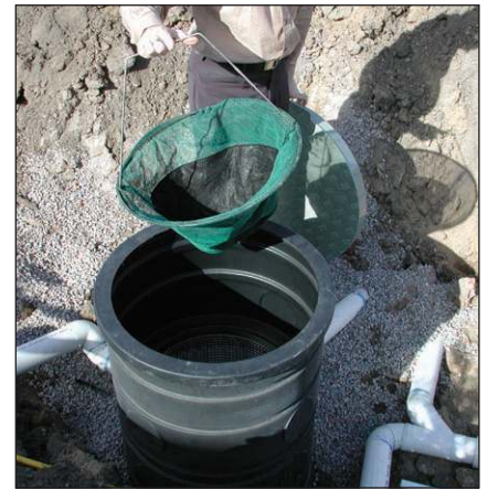
The trash screen collects all gross pollutants and micro pollutants as small as 180 microns.