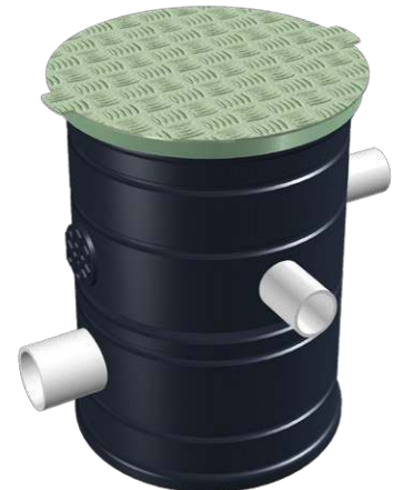
Large Filtration Unit