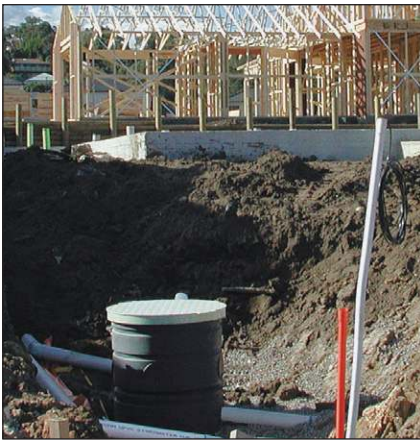
Installation of an Atlantis® Filtration Unit in the garden area of new home.