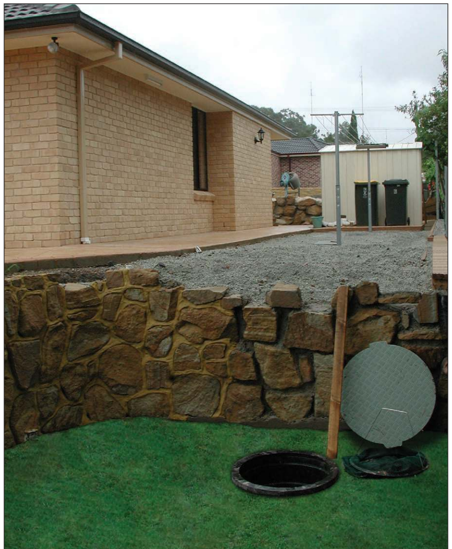
An Atlantis ® Filtration Unit installed into the garden area.