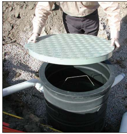
The large Atlantis® Filtration Unit features a lightweight aluminium lid allowing easy access for maintenance.