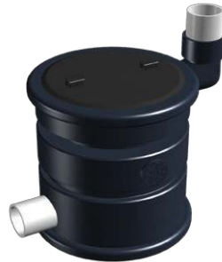
Small Filtration Unit